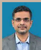
T. N. Krishnan