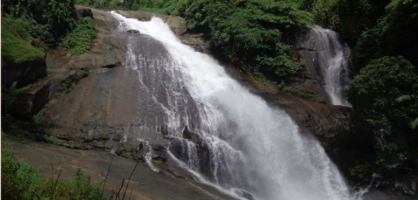
Thusharagiri Water falls, Kozhikode

home country concerned along with the Acceptance Letter issued by the Exchange Chairperson. If there is any particular stamp/seal on visa, the students are advised to inform the same to IIMK International Exchange Office upon their arrival in India.