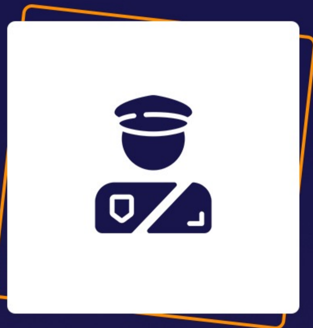
Chief Operating Officer (COO)

Learners poised for senior leadership positions, such as: