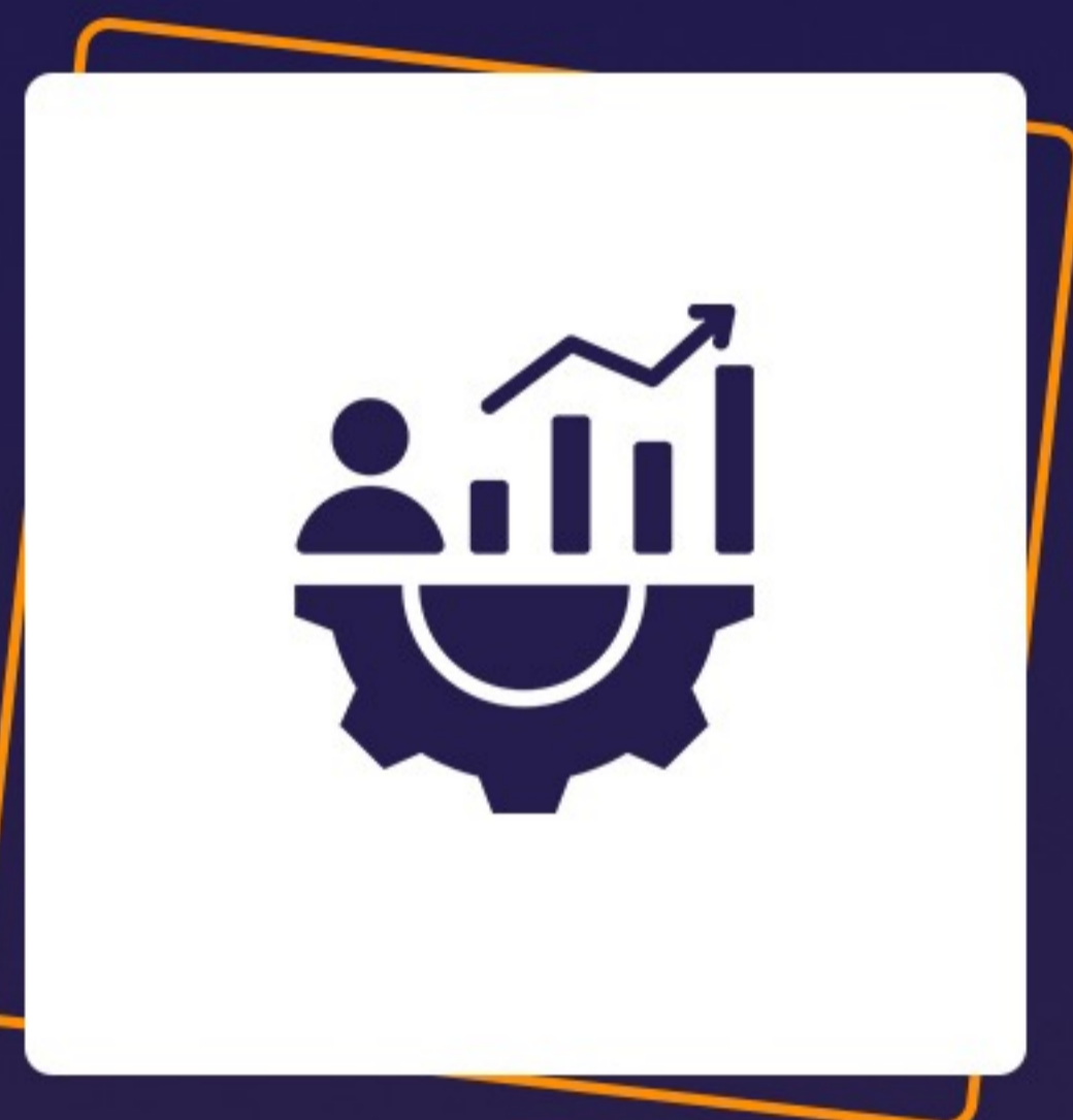
Head of Business Development