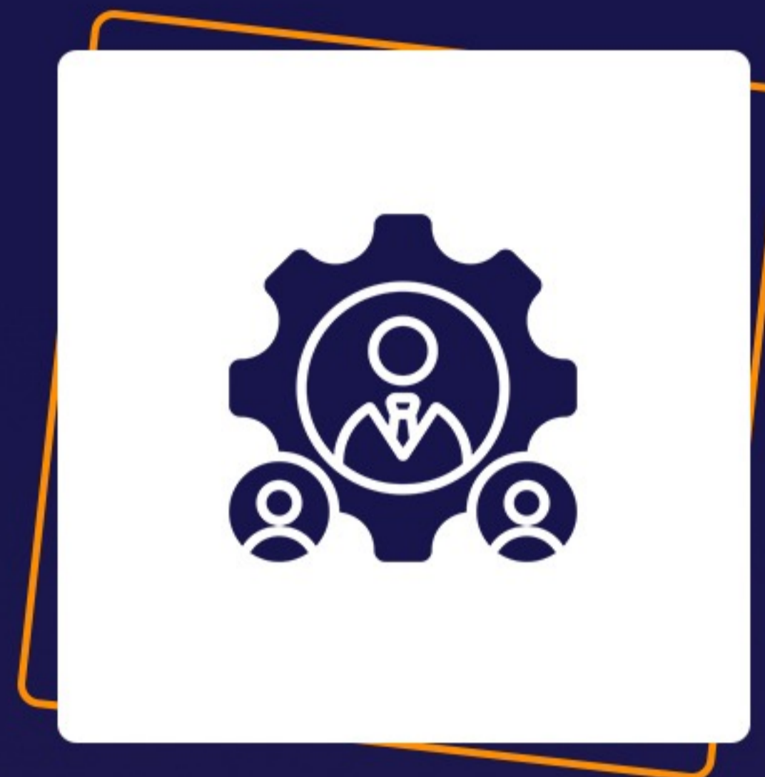
Vice President of Operations