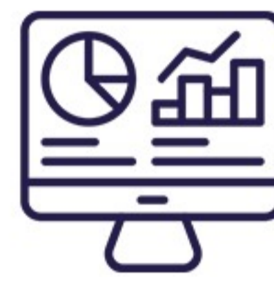
Data Storytelling & Visualization