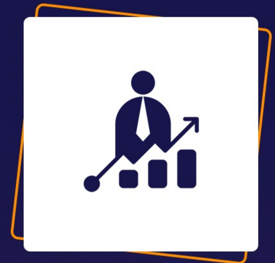
Director of Strategic Initiatives