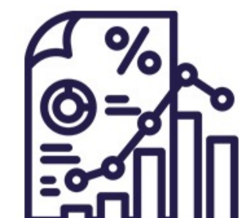
Strategic Planning and Execution