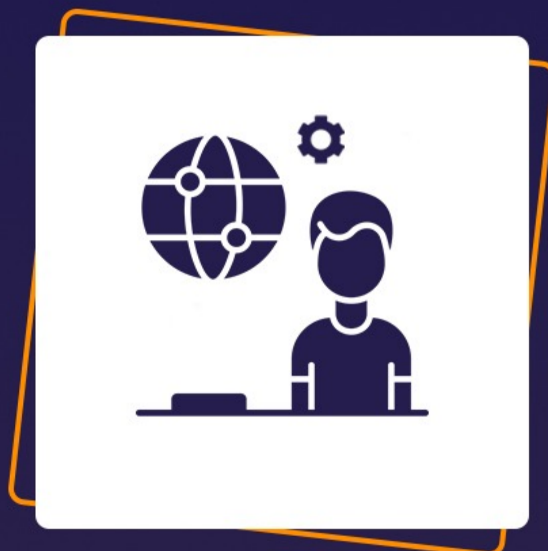
Senior Manager of Global Operations