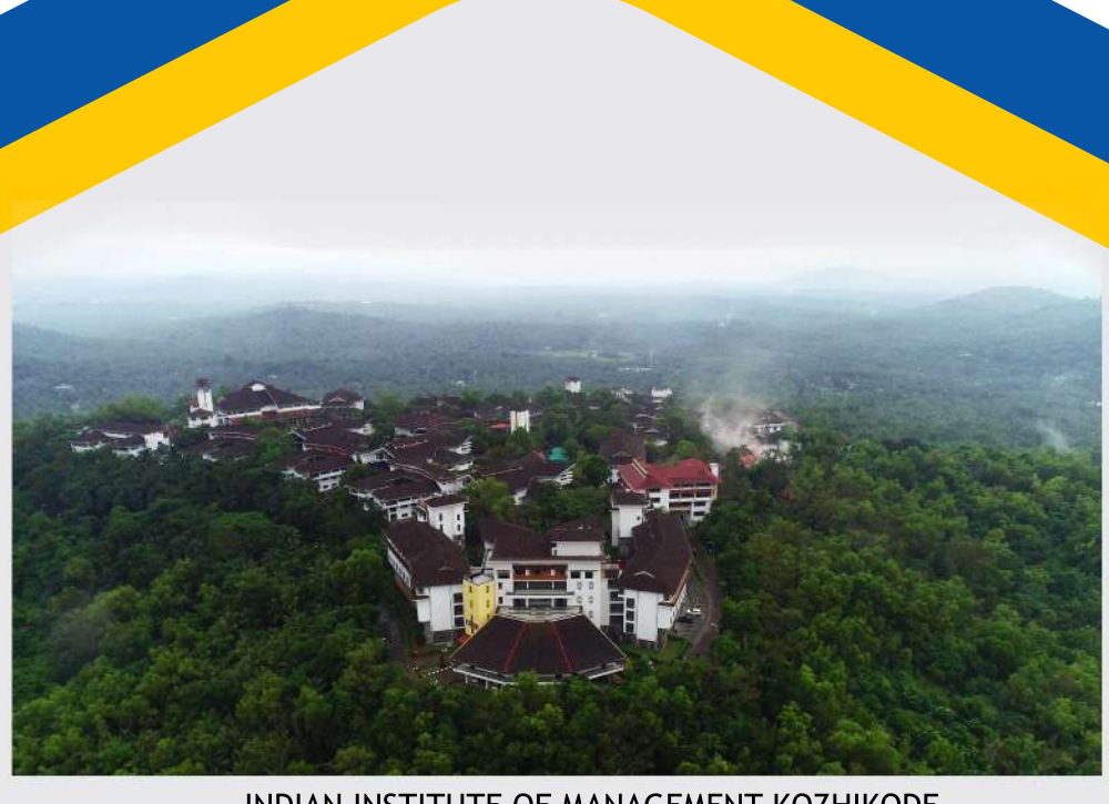
INDIAN INSTITUTE OF MANAGEMENT KOZHIKODE IIMK Campus P.O,

Kozhikode - 673 570, Kerala, India. Phone: +91-0495-2809558, +91 0495 2809560